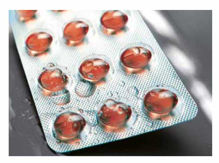
Blister packaging film made with TOPAS

With its remarkable property profile compared with known plastics, TOPAS* COC offers new options for these applications.