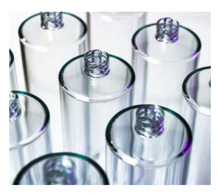
Prefillable syringes Schott TopPac™, manufactured by Schott Glas

For this reason, a number of TOPAS® COC grades have been studied in a biocompatibility test program. The TOPAS® COC grades studied meet the requirements of US Pharmacopoeia XXIII Class VI and ISO 10993. Certificates are available on request.